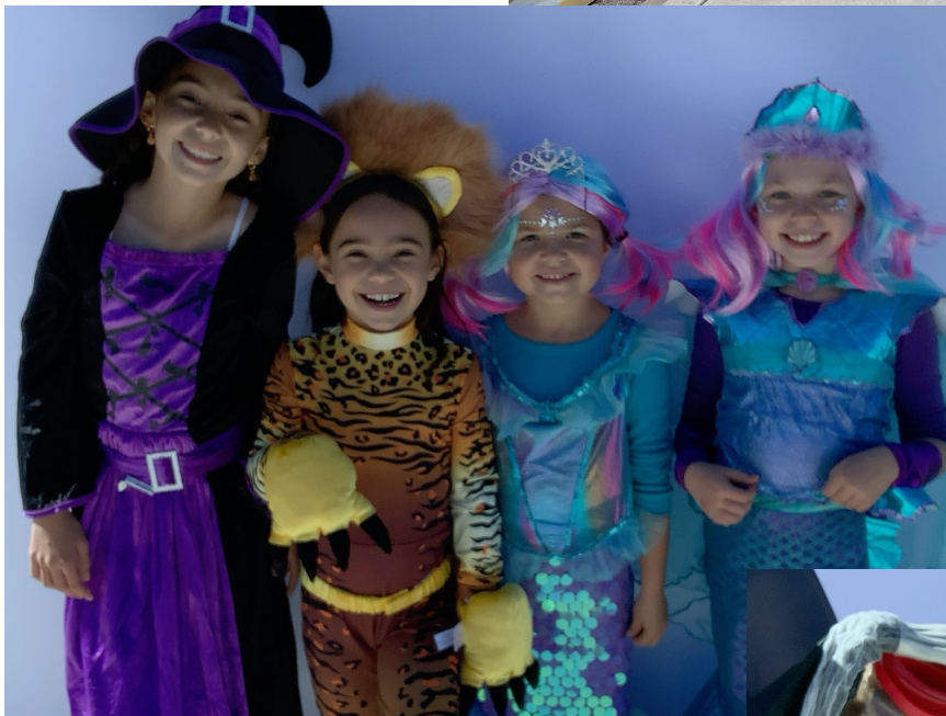
Fall Festival Costume Contest and Photo Booth