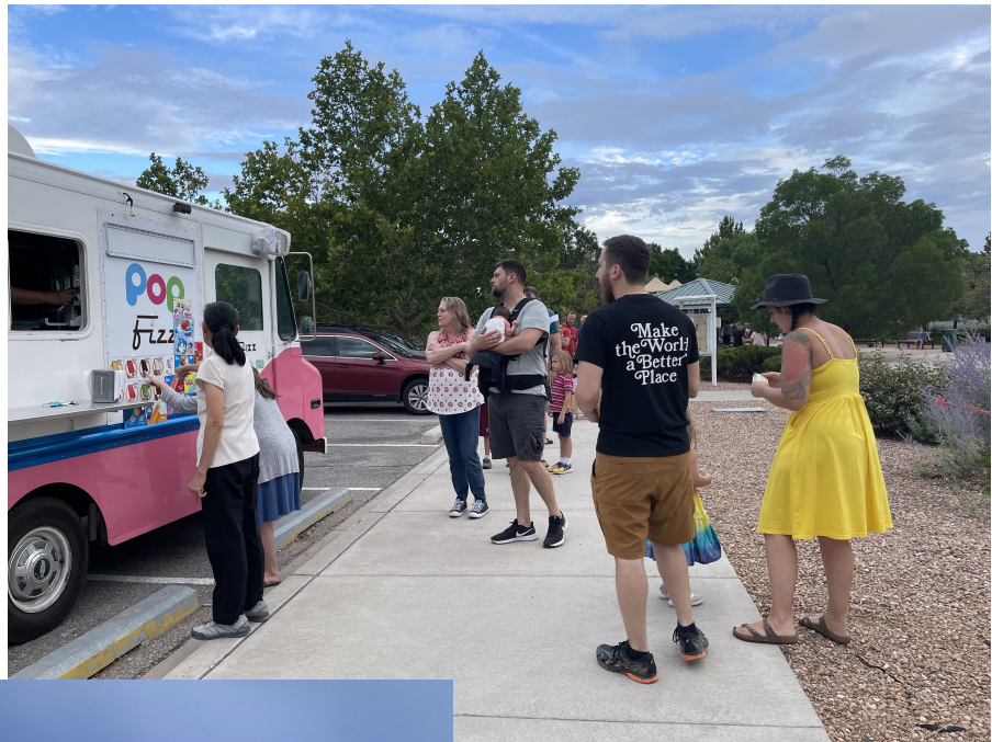
4th of July Popsicle Party