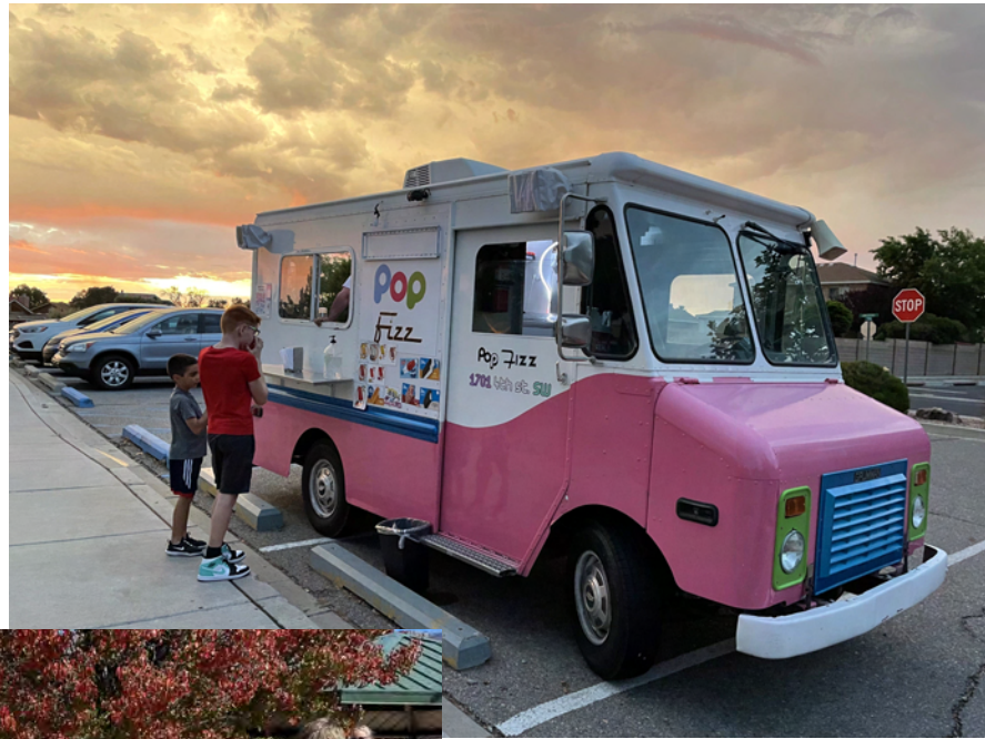
4th of July Popsicle Party