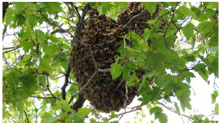
Bees swarm when their hive is too crowded. If you see a swarm, call 311 for help relocating it.

In August 2016, the Albuquerque City Council unanimously approved a resolution designating Albuquerque A Bee Friendly City. Becoming the first city in the Southwest to receive this bipartisan designation means it's okay to raise honeybees in the city; just ensure the hive/hives are appropriately located. See beecityusa.org for more info.