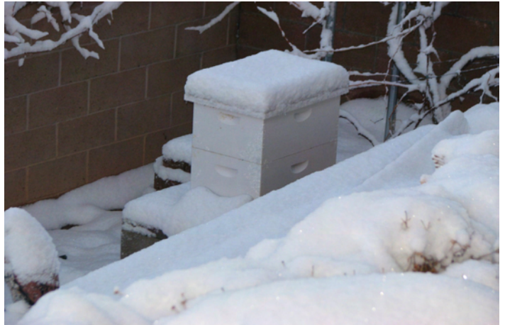
The author's hive in winter

Their innate discerning abilities ensure hive harmony; it's all for one and