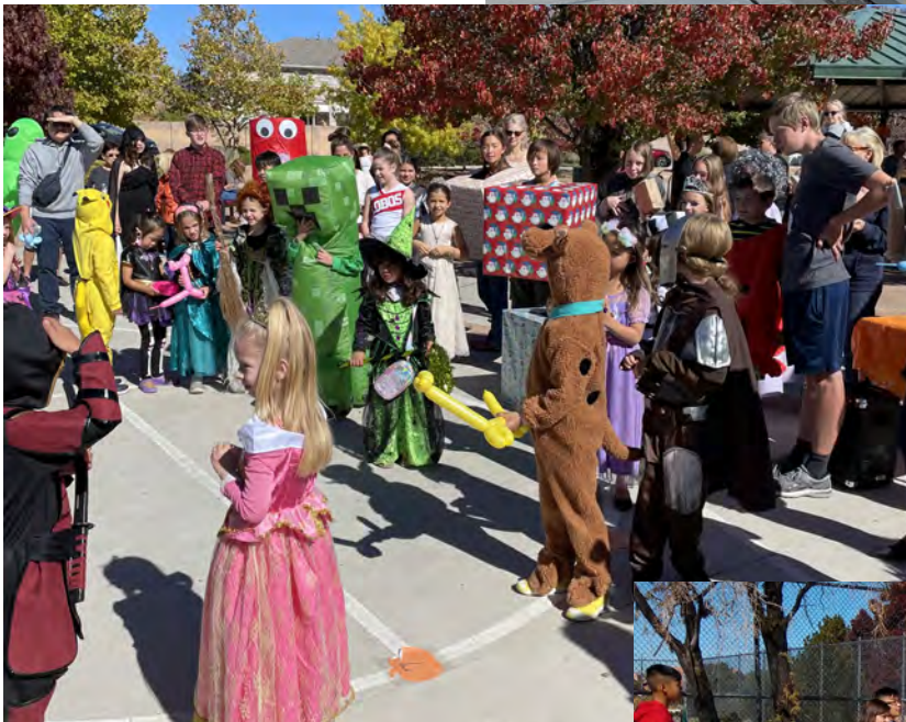
Fall Festival Costume Contest and Carnival Games