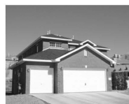
Ankara Road NE SOLD! SOLD! SOLD!