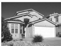
Irbid Road NE

Call Today For Your FREE Market Analysis! (505) 269-6217 "We do things Right for YOU!"