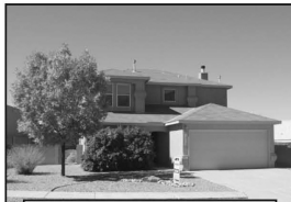
Irbid Road NE

POPULAR QUINTESSENCESPACIOUS, LIGHT AND BRIGHT TWO STORY CUSTOM BY KAUFMAN AND BROAD ON EASY MAINTENANCE MOUNTAIN VIEW LOT! Easy maintenance xeriscaped front yard. Inviting entry foyer. Spacious greatroom with custom fireplace. Formal dining room with raised ceiling, custom light fixture, neutral carpeting, ample wall space, easy kitchen access plus outdoor/backyard access. Eat-in country